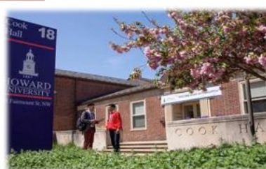
George W. Cook Hall