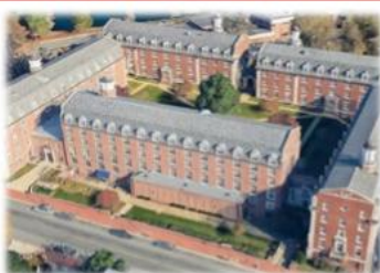
The Harriet Tubman Quadrangle (The Quad)