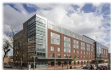
College Hall South

*On occasion, and in consideration of space availability, students may be assigned to residence halls typically designated for a different class year. These decisions are made carefully, with the goal of ensuring students are accommodated in a residential environment.