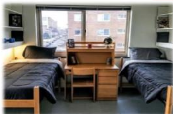
Charles R. Drew Hall