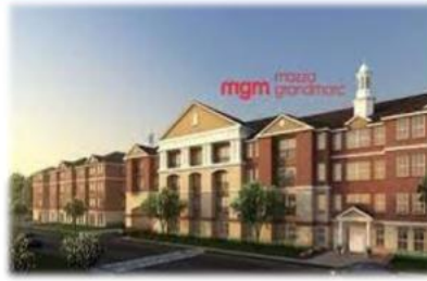
Mazza GrandMarc College Park, MD