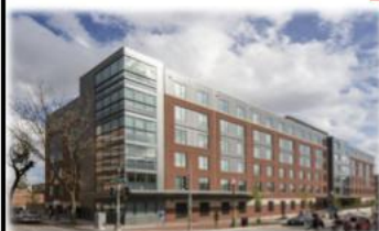
College Hall South