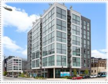
The Lanes DC Union Market