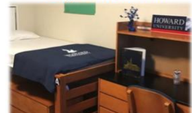
College Hall North

If overflow is required, students will be placed in room types closest to their preferred price.