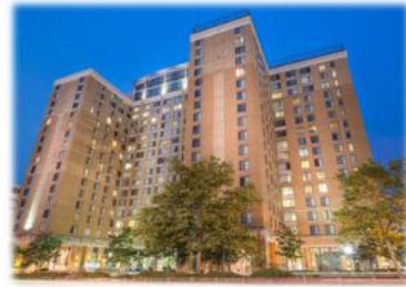
Vie Towers Hyattsville, MD