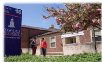
George W. Cook Hall