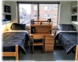
Charles R. Drew Hall