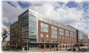
College Hall South

*On Occasion, students may be placed out of consideration for space availability.*