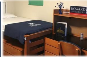
College Hall North

BETHUNE ANNEX, COLLEGE HALL SOUTH, AND AXIS HAVE BEEN USED AS OVERFLOW BUILDINGS FOR FTICS 2024. FTICS WILL BE MOVED WITH THEIR ROOMMATE TO AN AVAILABLE FTIC HALL IF AVAILABILITY OPENS. THEIR MOVE-IN DATE WILL REMAIN THE SAME.