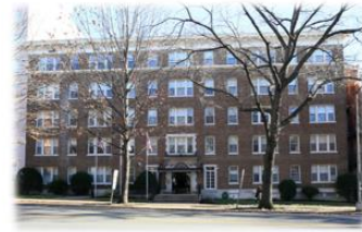
WISH Woodley Park