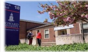
George W. Cook Hall