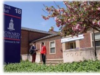
George W. Cook Hall