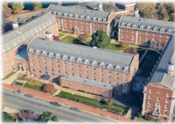
The Harriet Tubman Quadrangle (The Quad)

BETHUNE ANNEX, COLLEGE HALL SOUTH, AND AXIS HAVE BEEN USED AS OVERFLOW BUILDINGS FOR FTICS 2024. FTICS WILL BE MOVED WITH THEIR ROOMMATE TO AN AVAILABLE FTIC HALL IF AVAILABILITY OPENS. THEIR MOVE-IN DATE WILL REMAIN THE SAME.