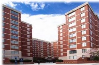
Howard Plaza Towers East and West